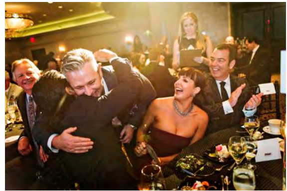
Houston Knuckle Ball 2016