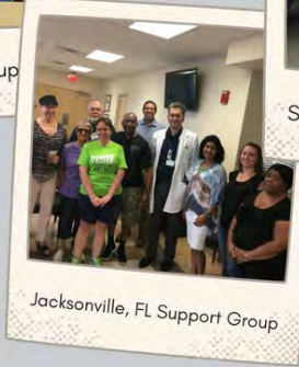
Jacksonville, FL Support Group