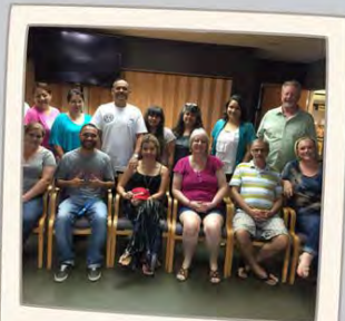
San Diego, CA Support Group