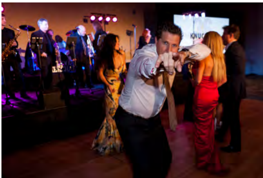
Phoenix Knuckle Ball 2016