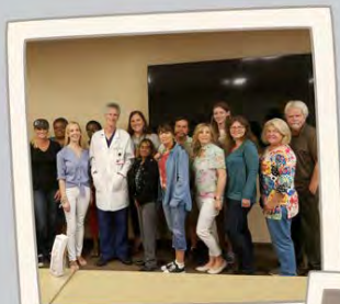
Phoenix, AZ Support Group

For those affected by a brain aneurysm, AVM or hemorrhagic stroke